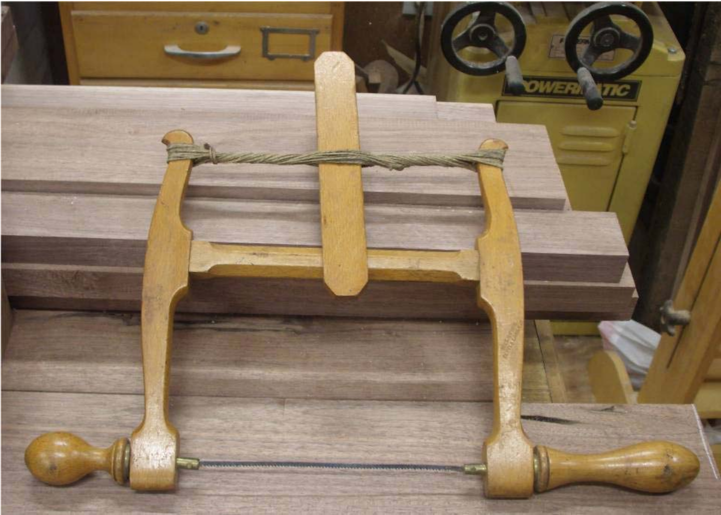
This is a coping saw sized bowsaw. It uses tapered brass pins. It can use modern coping saw blades, but the cross pins need to be tapped out so that the blades can be installed into the tapered pins with brads.